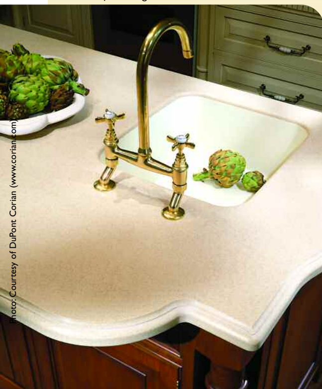
Solid surface integral sink

In years gone by, choosing a kitchen sink was not a difficult proposition. You basically had two options: cast iron or stainless steel. Today there are a myriad of choices, which can make planning your new kitchen very exciting and quite overwhelming all at the same time.