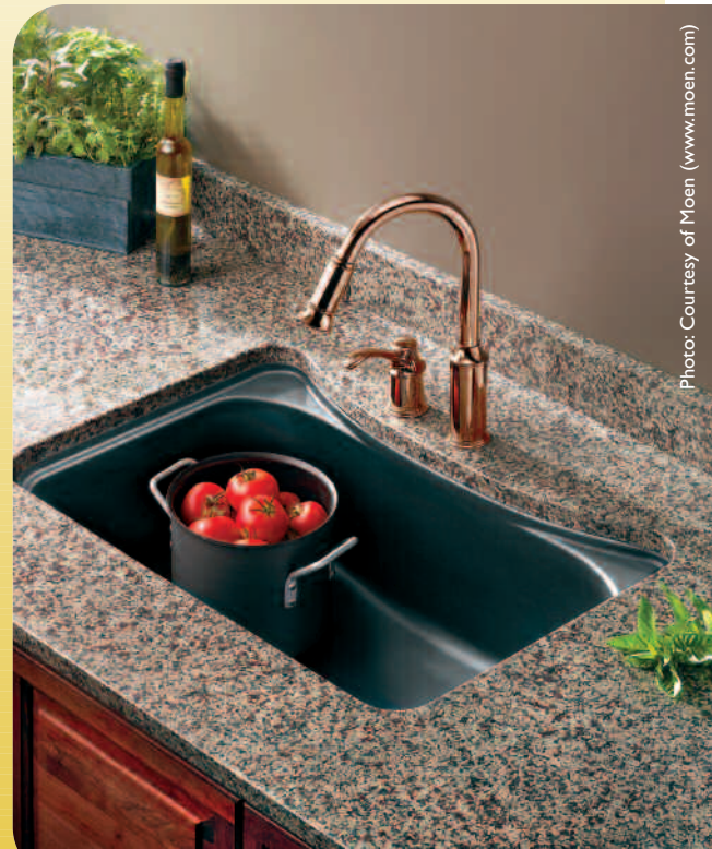
Granite composite sink

GRANITE COMPOSITE sinks are formed from the most durable sink material on the market today, which is 80% granite, 20% acrylic resin. This material offers extreme stain, chip and scratch resistance and is non-porous. It has a heat rating of up to 535°F, so that a pan can go from stove to sink without marring the surface. These sinks will hinder thermal conductivity to keep dishwater warm longer. The color runs throughout the material, which is available in matte finishes only. □