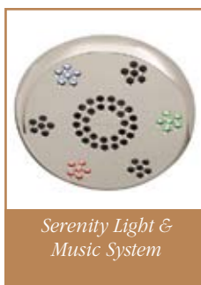
Serenity Light & Music System

A steam shower requires your shower enclosure be properly constructed and moisture-sealed. The generator may be concealed anywhere within 25 feet from the shower, such as in a linen closet. Even though your electric bill may go up when using a steam shower, it still can be considered an eco-friendly way to bathe—it uses 1-2 gallons of water per 20 minutes of steaming versus 50 gallons with a water-saving showerhead in the same amount of time.