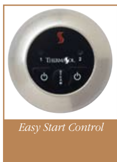
Easy Start Control