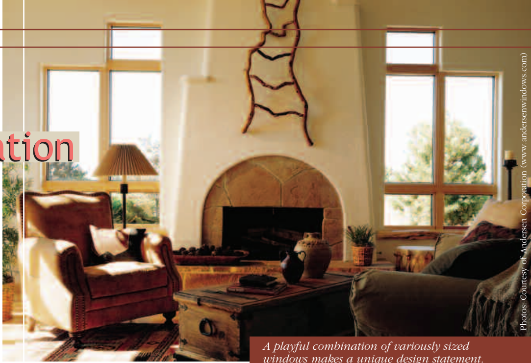
A playful combination of variously sized windows makes a unique design statement.

Consider all the advantages of a window— it provides natural light; it connects you with views of your outside surroundings; it brings in fresh air; and it enhances the appearance of your home's interior and exterior. Windows are an important element of any home, yet are often overlooked during the design phase. Many times the decision of where to position a window is based solely on keeping a home's facade symmetrical, rather than optimizing how the window serves the room in which it is placed.