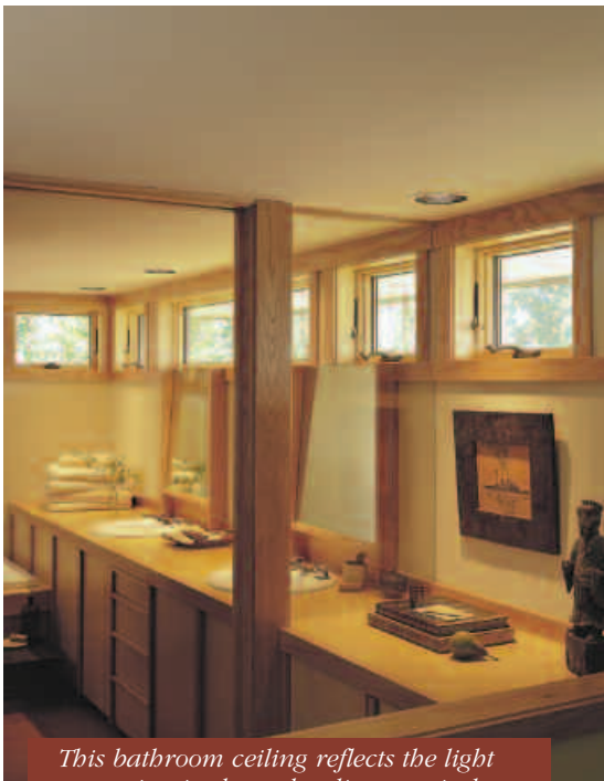
This bathroom ceiling reflects the light streaming in through adjacent windows.