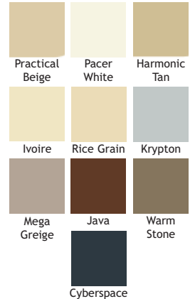
Understated Elegance Color Palette