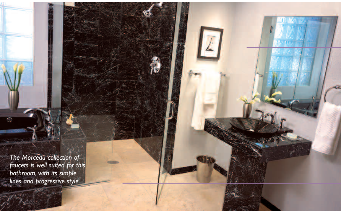
The Morceau collection of faucets is well suited for this bathroom, with its simple lines and progressive style.

VISA, MASTERCARD, DISCOVER