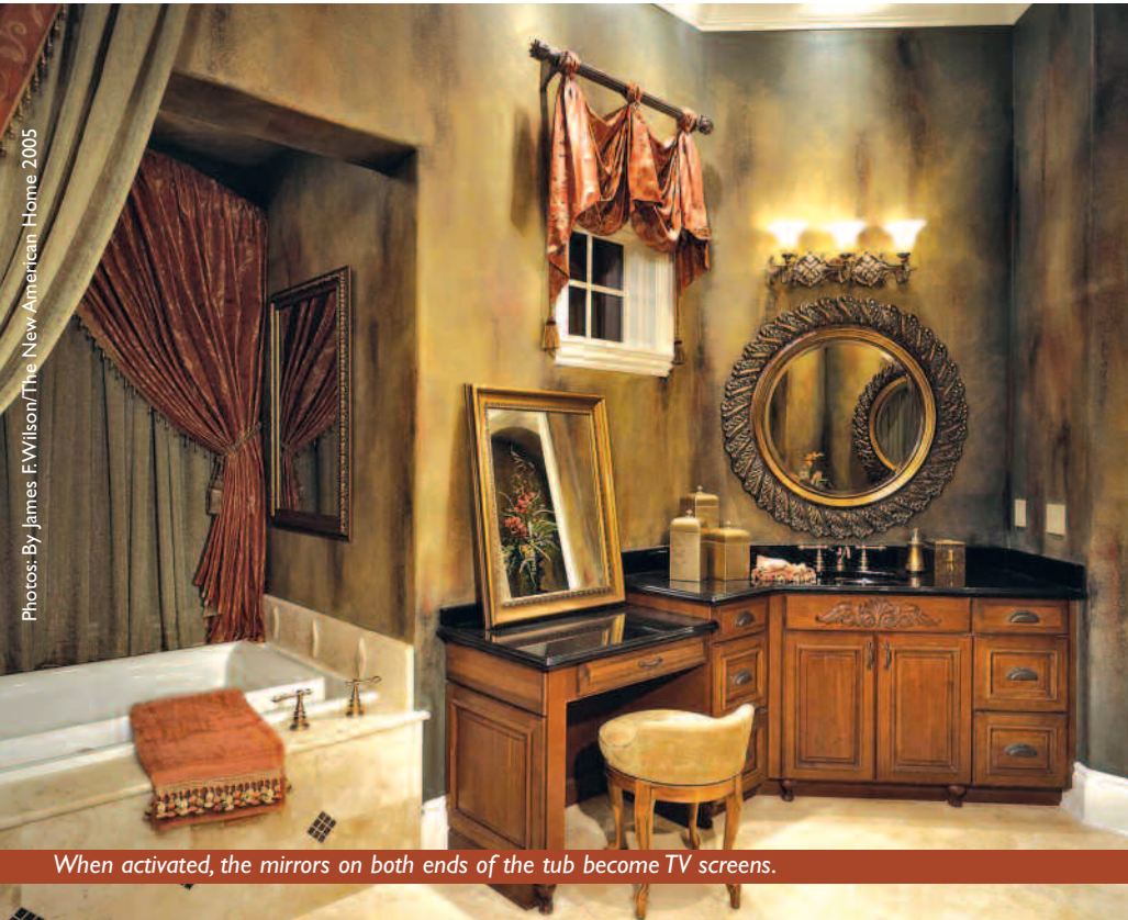
When activated, the mirrors on both ends of the tub become TV screens.

master suites are the third most popular remodeling project today, right after kitchens and baths. With continuous remodeling shows on television as inspiration, people are ripping out, reconfiguring and adding on to their master bedrooms as never before.