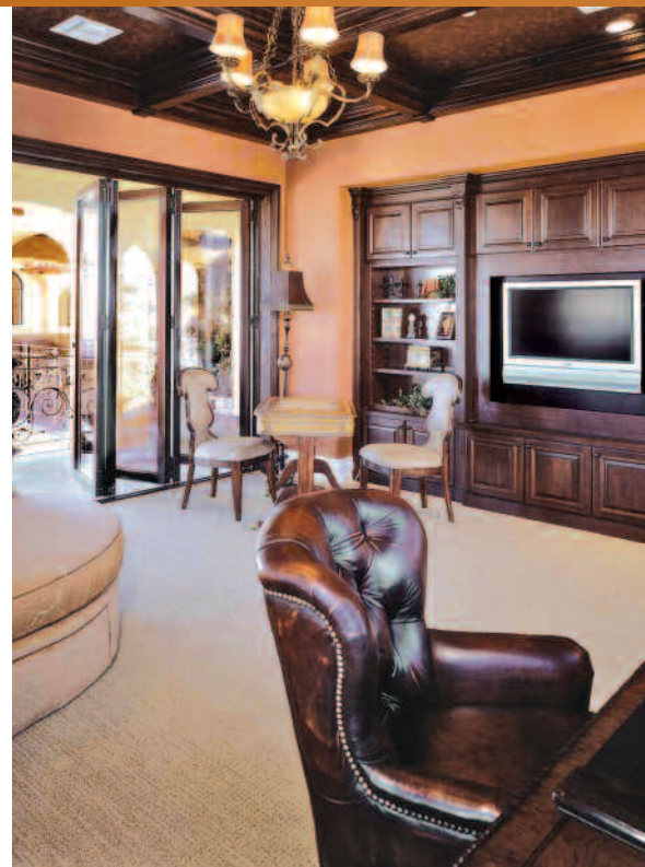
The folding glass wall expands the sitting room to the outside, bringing in light and fresh air.