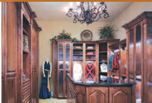
Stylish lighted closet rods add sparkle to this walk-in closet.

those parents who simply want a quiet respite from the pre-teens who seem to have taken over their house. An addition to their home provides a tranquil spot for a master suite retreat. Or perhaps it is simply that the homeowner spent some wonderful days in a five star hotel suite with all the creature comforts, and now wants to recreate that luxurious atmosphere with his own "house candy." Whatever the reason for the decision,